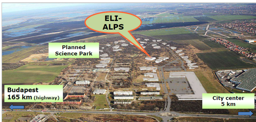
Figure 1 Location of ELI-ALPS and a planned Science Park