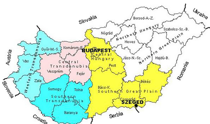
Figure 2 Regions and counties of Hungary

In Hungary there are 7 regions of NUTS2 level, including 3-3 counties of NUTS3 level (Figure 2).